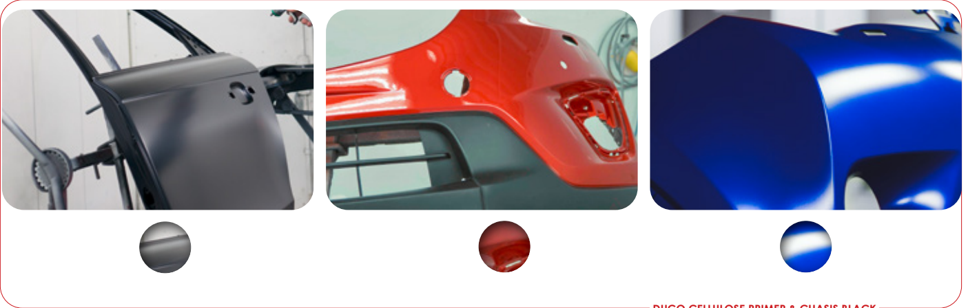
DUCO CELLULOSE PRIMER & CHASIS BLACK